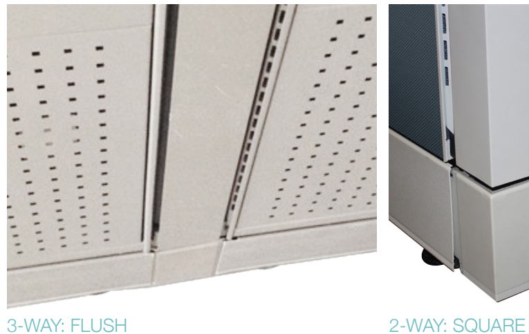
2-WAY: SQUARE SHAPED