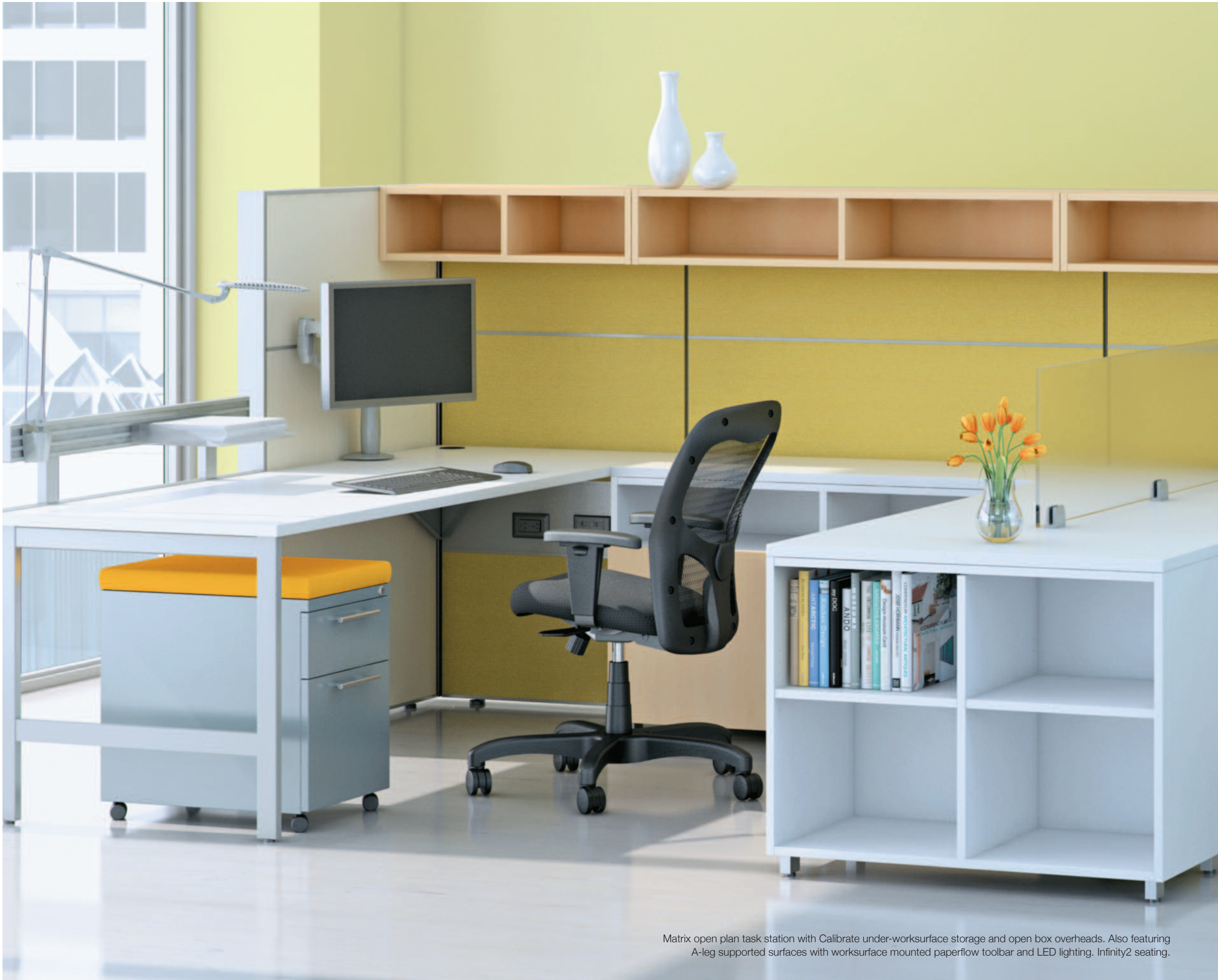
Matrix open plan task station with Calibrate under-worksurface storage and open box overheads. Also featuring A-leg supported surfaces with worksurface mounted paperflow toolbar and LED lighting. Infinity2 seating.

When coupled with Calibrate components and accessories, work areas become collaborative and modern with a twist of elegance. With virtually limitless options, Matrix can bring your office space to a new level of sophistication.