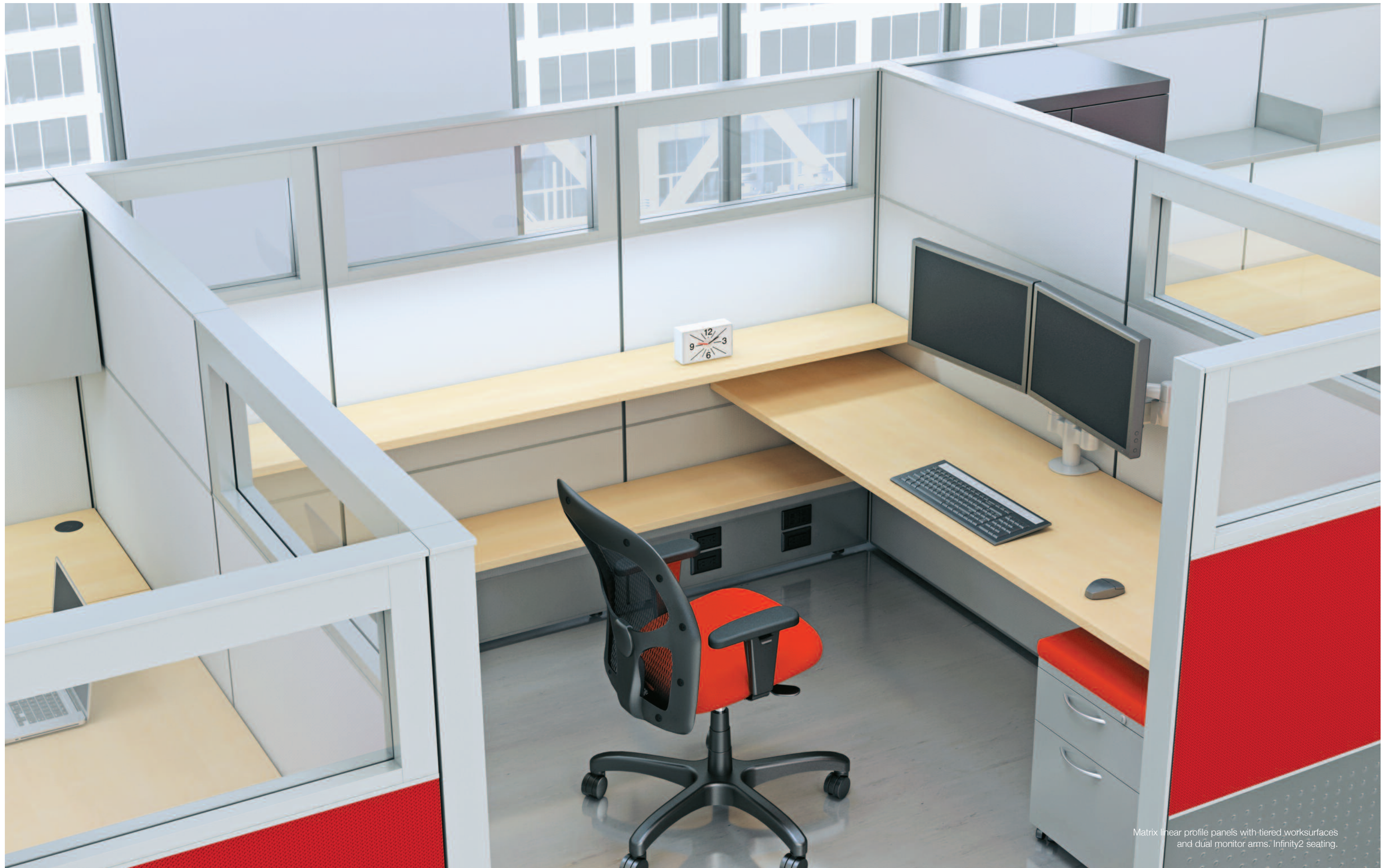
Matrix linear profile panels with tiered worksurfaces and dual monitor arms. Infinity2 seating.