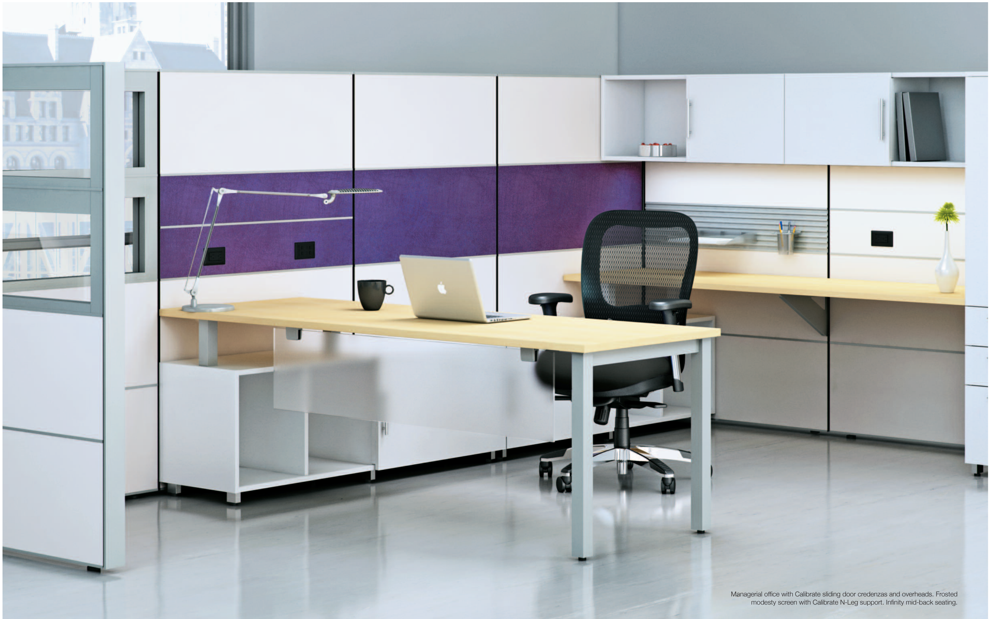
Managerial office with Calibrate sliding door credenzas and overheads. Frosted modesty screen with Calibrate N-Leg support. Infinity mid-back seating.